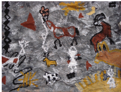
Prehistoric Cave Painting, 7th grade